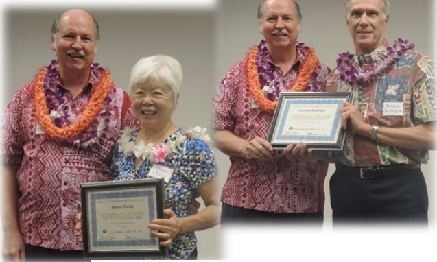
Diana Chang & Jerome Berlinger Distinguished Service Award